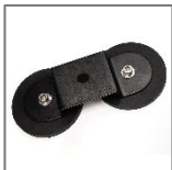
No Drill Magnetic Mounts ABM088CXX

The most popular accessories for this model are shown here. For additional details regarding these or other accessories please see our website or contact us directly.