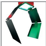
Line Length Limiting Panels AVLLLKXXX